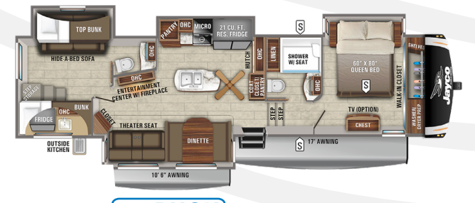
347BHOK A, B, D, E, G Ext. Lgth: 41' 2 " Weight: TBD Hitch: TBD