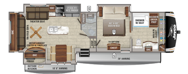
336FBOK A, E, G Ext. Lgth: 39' 8" Weight: TBD Hitch: TBD