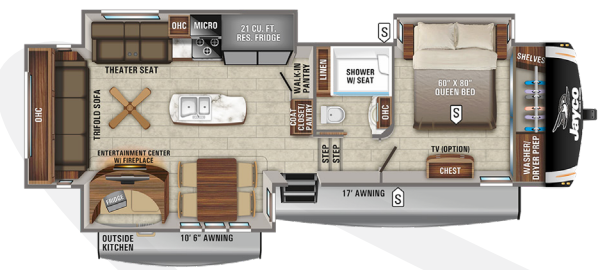
317RLOK A, E, G Ext. Lgth: 36' 5" Weight: 11,025 lbs. Hitch: 2,165 lbs.