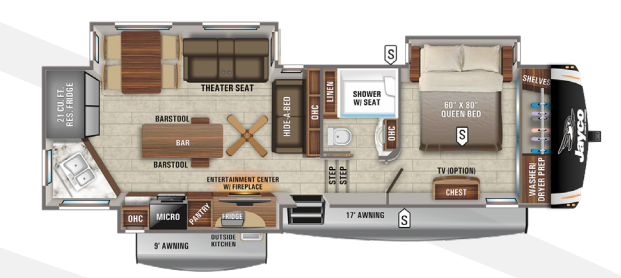
319MLOK A, E, F, G Ext. Lgth: 36' 7 " Weight: 10,940 lbs. Hitch: 2,060 lbs.